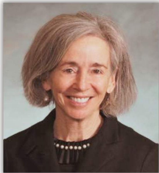
Resource: Colorado General Assembly

"It's not good for the well-being of our young people, and when they are exposed to it, sometimes it [marijuana] can throw them into a psychotic episode... I don't want any child to access something that is dangerous or harmful. And we should all want that for the state of Colorado."