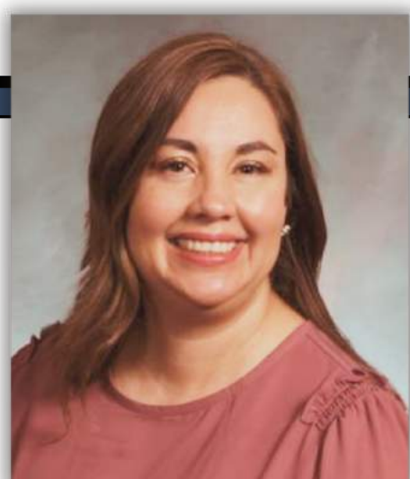
Resource: Colorado General Assembly

The story on our adolescent unit is even more tragic, as we repeatedly treat kids that are too psychotic to know what's real, who they can trust, or where they are. The rates of adolescent psychosis have risen steadily since legalization, and in almost every case it's linked to high potency THC concentrates. Products known as dabs, wax, and shatter that are made in the lab by distilling down the most psychoactive component of the marijuana plant and concentrated into what's better described as a hard drug that (is not) the 'weed' people voted for with Amendment 64..."