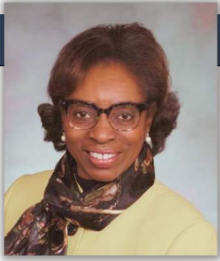
Resource: Colorado General Assembly