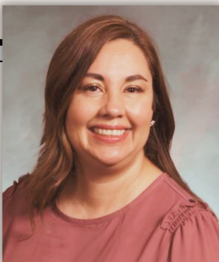
Resource: Colorado General Assembly

The story on our adolescent unit is even more tragic, as we repeatedly treat kids that are too psychotic to know what's real, who they can trust, or where they are. The rates of adolescent psychosis have risen steadily since legalization, and in almost every case it's linked to high potency THC concentrates. Products known as dabs, wax, and shatter that are made in the lab by distilling down the most psychoactive component of the marijuana plant and concentrated into what's better described as a hard drug that (is not) the 'weed' people voted for with Amendment 64..."