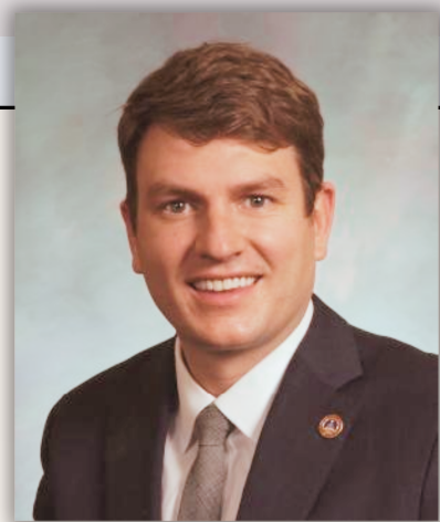
Resource: Colorado General Assembly

On May 18, 2021, Colorado Speaker of The House Alec Garnett held a press conference to introduce HB21-1317, Regulating Marijuana Concentrates , a grassroots bi-partisan bill supported by over 50 Colorado organizations from both sides of the aisle. A tidal wave of Colorado youth and families testified in support of the bill, sharing their personal stories of the horrific outcomes caused by Colorado's high-potency legal marijuana products. On June 24, 2021, HB21-1317 was signed into law by Governor Jared Polis.